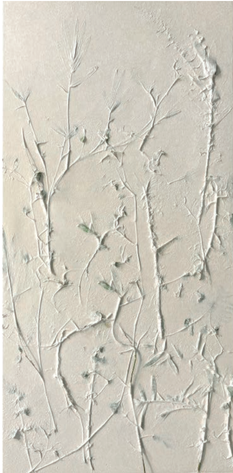
《Forest Floor “森の地面”》 washi and plants, (和紙、植物) 200 × 100cm 2024 produced at Awagami Factory アワガミファクトリーにて制作