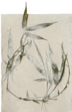
《Bamboo “竹”》 washi and bamboo, (和紙、竹) 37 × 26 cm 2024 produced at Awagami Factory アワガミファクトリーにて制作