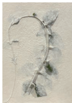
《Vine “蔓”》 washi and vine, (和紙、蔓) 37.5 × 26 cm 2024 produced at Awagami Factory アワガミファクトリーにて制作