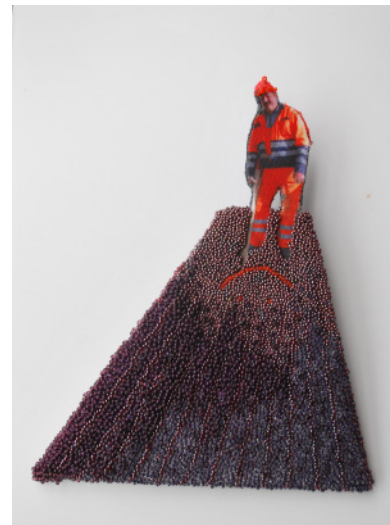
"Roadmen" 15.5x18 cm, 2019

Born 1969.Feb.24 , Kaunas, Lithuania Associate Professor of Vilnius Art Academy. Member of the Artist Union of Lithuania Republic.