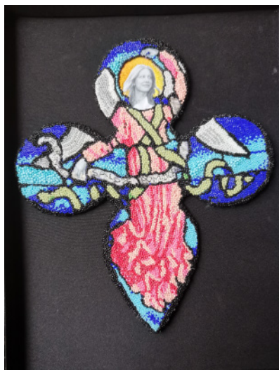
"Threads of Time 2" 19x21 cm, 2023