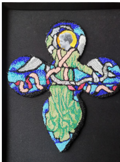
"Threads of Time" 19x21 cm, 2023