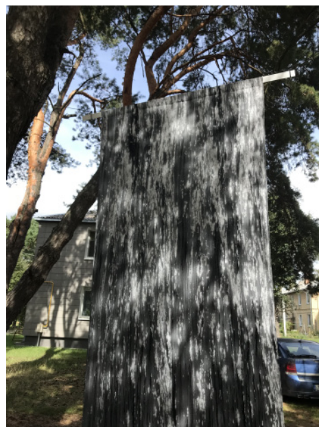
"White Flow"2023 digital jacquard weaving 310 x 120 cm

Born 1975.Oct.27, Kaunas, Lithuania Associate Professor of Vilnius Art Academy. Member of the Artist Union of Lithuania Republic. Board member of Kaunas Art Biennial