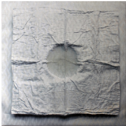
"Water" 2023 Double hand weaving, digital print. 90 x 90 cm.