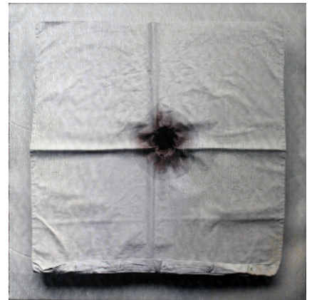
"Vine" 2023 Double hand weaving, digital print. 90 x 90 cm

Born 1959.Feb.13 Vilnius, Lithuania Professor of Vilnius Art Academy. Member of the Artist Union of Lithuania Republic. Member of the Board of Kaunas Art Biennial